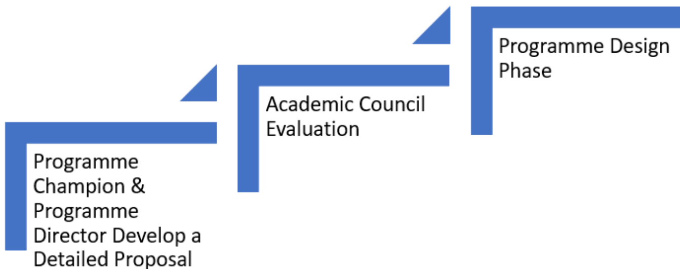
Figure 2 - Second and Third Phases in Programme Development leading to Programme Design

The following Chart outlines the Second and Third Phases in Programme Development leading to Programme Design